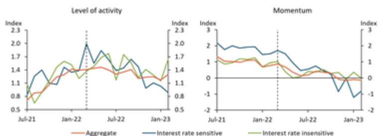
Chart 3: Activity and momentum have noticeably cooled in interest-rate-sensitive industries, while insensitive industries lag behind

Notes: All series are indexed to 100 six months after the start of monetary policy tightening. Series are the average of data from the mid-1990s, early 2000s, and mid-2000s tightening cycles. Sources for model input data can be found in the data appendix. Source: Authors' calculations.