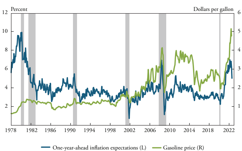
Chart 1 Households' Short-Term Inflation Expectations and the Price of Gasoline

households' inflation expectations (Hastings and Shapiro 2013; Georganas, Healy, and Li 2014; Coibion and Gorodnichenko 2015; Binder 2018). The volatile nature of gasoline prices contributes to this correlation, as consumers are more likely to remember extreme movements in prices and use them to form expectations about the future (Bruine de Bruin, van der Klaauw, and Topa 2011). Chart 1 presents visible evidence of the positive association between gasoline prices and oneyear ahead inflation expectations from the MSC. For example, inflation expectations (blue line) rose in the mid-2000s, fell in 2008, and then rose again from 2009 to 2011, in line with swings in gasoline prices (green line).