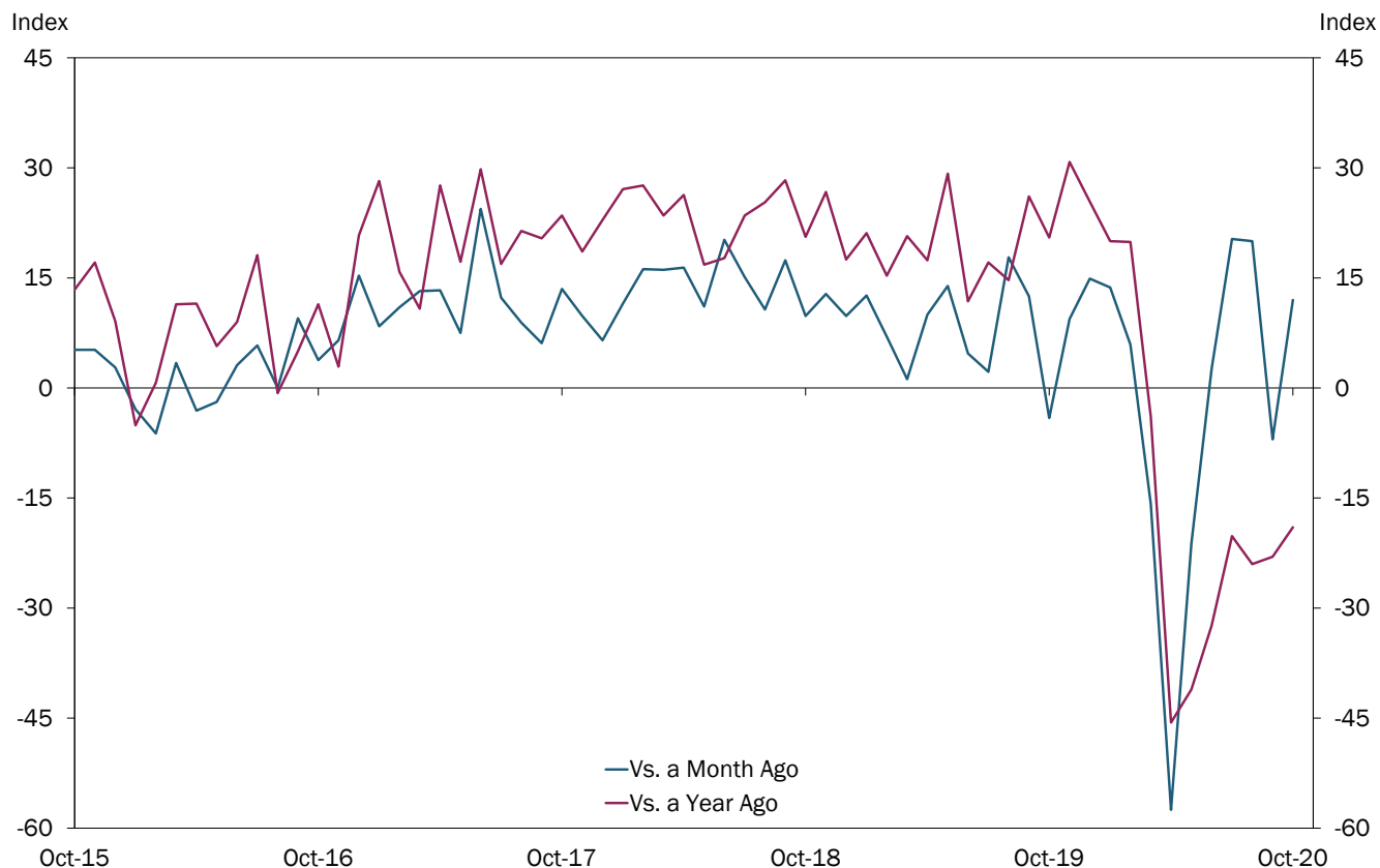
Chart 1. Services Composite Indexes

Note: The October survey was open for a five-day period from October 14-19, 2020 and included 87 responses from firms in Colorado, Kansas, Nebraska, Oklahoma, Wyoming, northern New Mexico, and western Missouri.