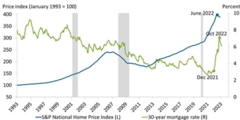
Chart 1: Home prices and mortgage interest rates rose sharply during the pandemic

Notes: Price data are through November 2022; mortgage rates are through early February 2023. Gray shaded areas indicate recessions as defined by the National Bureau of Economic Research (NBER). Sources: Standard and Poor's, Federal Home Loan Mortgage Corporation, and NBER. All data accessed through Haver Analytics.