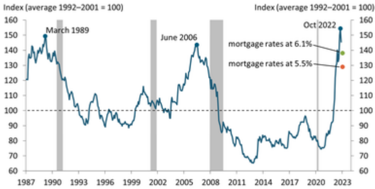
Chart 3: Home prices appear overvalued relative to rents

Notes: Index is the ratio of homeownership costs relative to the rent for a similar home. Price and rent data are through November 2022. Gray shaded areas indicate NBER-defined recessions. Sources: Standard and Poor's, Bureau of Labor Statistics, Federal Home Loan Mortgage Corporation, NBER, and author's calculations. All data accessed through Haver Analytics.