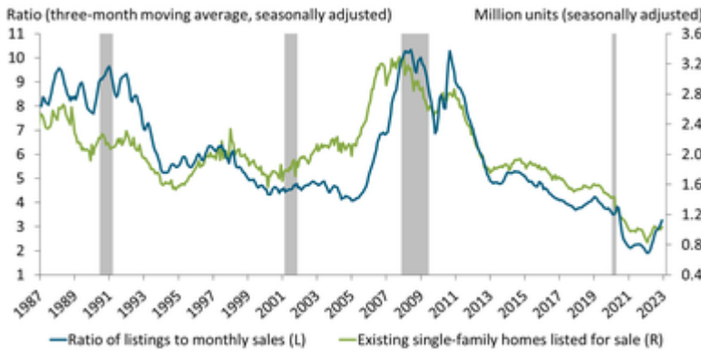
Chart 4: Sales listings of existing single-family homes remain close to their recent historical low

Notes: Index is the ratio of homeownership costs relative to the rent for a similar home. Price and rent data are through November 2022. Gray shaded areas indicate NBER-defined recessions. Sources: Standard and Poor's, Bureau of Labor Statistics, Federal Home Loan Mortgage Corporation, NBER, and author's calculations. All data accessed through Haver Analytics.