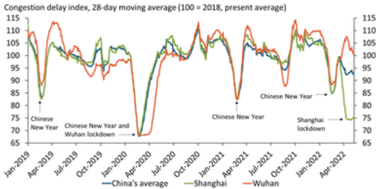
Chart 2: Congestion indexes show the current lockdown in Shanghai has been less severe Note: The national congestion index is constructed using a GDP-weighted measure of the 10 Chinese cities with the highest total output.