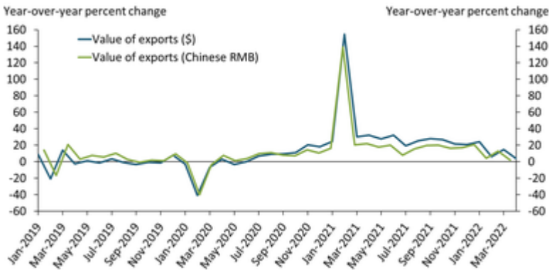
Chart 3: Export growth also declined in recent months in China