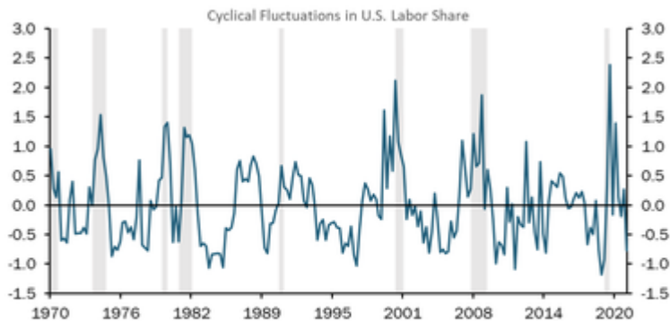
Chart 1: Labor Share of Income Tends to Rise During Economic Downturns

Note: The cyclical component of the U.S. labor share of income is extracted by applying the Hodrick-Prescott Filter with a smoothing parameter of 1,600. Value above zero indicate the labor share is above its long-term trend level.