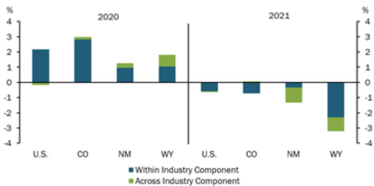
Chart 3: Shifts in Economic Activity Across Sectors Contributed to Changes in the Labor Share of Income in the Rocky Mountain Region

Sources: Bureau of Economic Analysis, Haver Analytics, author's calculations.