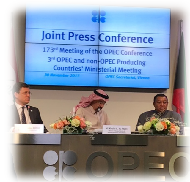
Former Russian oil minister Alexander Novak & former Saudi oil minister Khalid al Falih, 2017