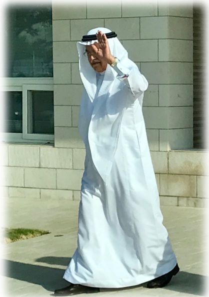
Former Saudi oil minister Ali al Naimi (Ellen R. Wald)