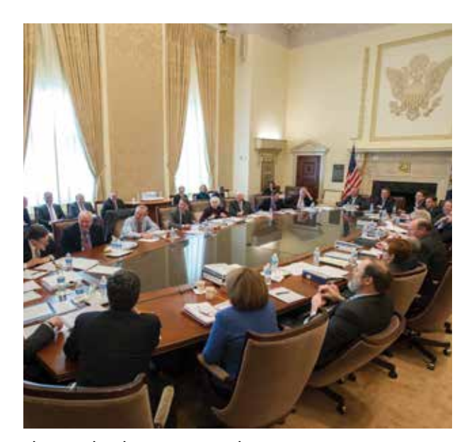
The Federal Open Market Committee meets in Washington, D.C., eight times a year.

I find recent research from the Bank for International Settlements to be compelling. This research sees financial market deregulation from the 1980s and 1990s as having increased the likelihood of crises and posits a growing financial cycle in which monetary policy responds asymmetrically over time to crises, easing rates aggressively during the crisis but raising rates only gradually after the crisis has subsided. Their prescription is for policymakers to break this cycle by making policy more attentive to financial imbalances and more symmetrical in the response.