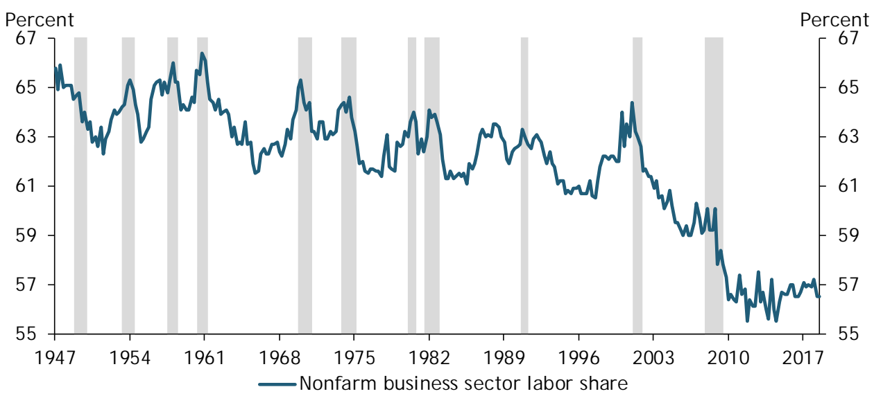
Chart 1: U.S. Nonfarm Business Sector Labor Share, 1947–2017

The U.S. labor share of income declined sharply from 2000 to 2010 but seems to have stabilized more recently, raising questions about the forces driving its trends. The labor share corresponds to the share of national income that is paid to workers in the form of labor compensation, which includes wage and salary compensation along with benefits. Until 2000, this share had been stable for over four decades. Chart 1 shows that the nonfarm labor share remained fairly stable between the late 1940s and the early 2000s, fluctuating around 63 percent. This stability resulted from two coincidental changes affecting the labor share in opposite directions (Elsby, Hobijn, and Şahin 2013; Armenter 2015). First, the composition of U.S. industries dramatically shifted away from manufacturing toward services during this period. Because the manufacturing industry had a relatively high labor share, while the services industry had a lower labor share, this shift in industry composition put downward pressure on the aggregate labor share, the weighted average labor share across all industries. Second, the services labor share began to rise, closing the gap with manufacturing and putting upward pressure on the labor share. The aggregate labor share remained stable during these five decades because the forces affecting it effectively cancelled each other out.