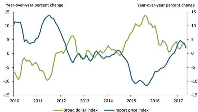
Chart 1: U.S. broad dollar index and import price index