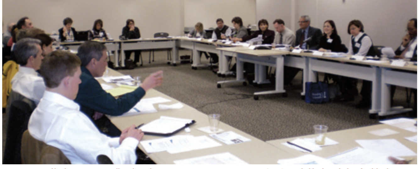
Representatives of lending institutions talk with regulators at a Community Reinvestment Act (CRA) roundtable about the benefit of developing a strong performance context in preparation for a CRA review.