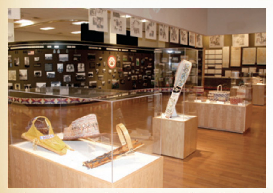
The Citizen Potawatomi Nation's Cultural Heritage Center in Shawnee, Okla., celebrates the cultural contributions of Native Americans to U.S. history. The Nation's various enterprises contribute to the local economy and employment base.

Stepping into the Citizen Potawatomi Nation's Cultural Heritage Center in Shawnee, Okla., takes visitors back in time to a rich period in history.