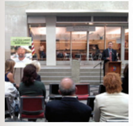
Denver Mayor John Hickenlooper helps kick-off Bank On Denver.

Denver Mayor John Hickenlooper, now governor of Colorado, delivered the keynote address for the Bank On Denver Kick-off Event on Oct. 4 at City Hall. To get involved in Bank On Denver, visit: http://bankondenver.org/ .