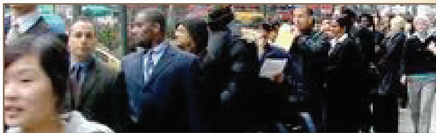
Changing age and ethnicity demographics are impacting workforce development.