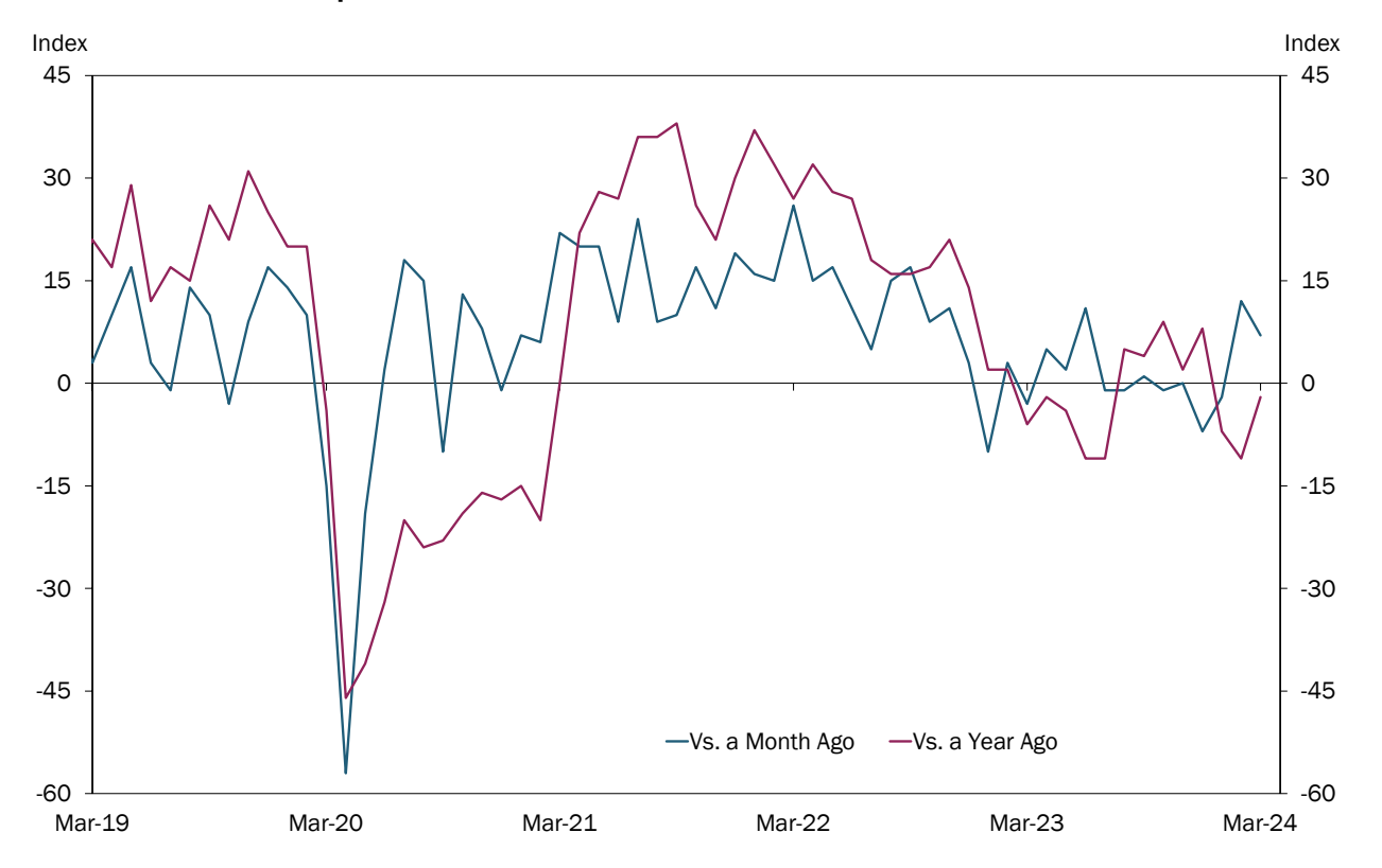
Chart 1. Services Composite Indexes

Note: The March survey was open for a six-day period from March 20-25, 2024 and included 68 responses from firms in Colorado, Kansas, Nebraska, Oklahoma, Wyoming, northern New Mexico, and western Missouri.