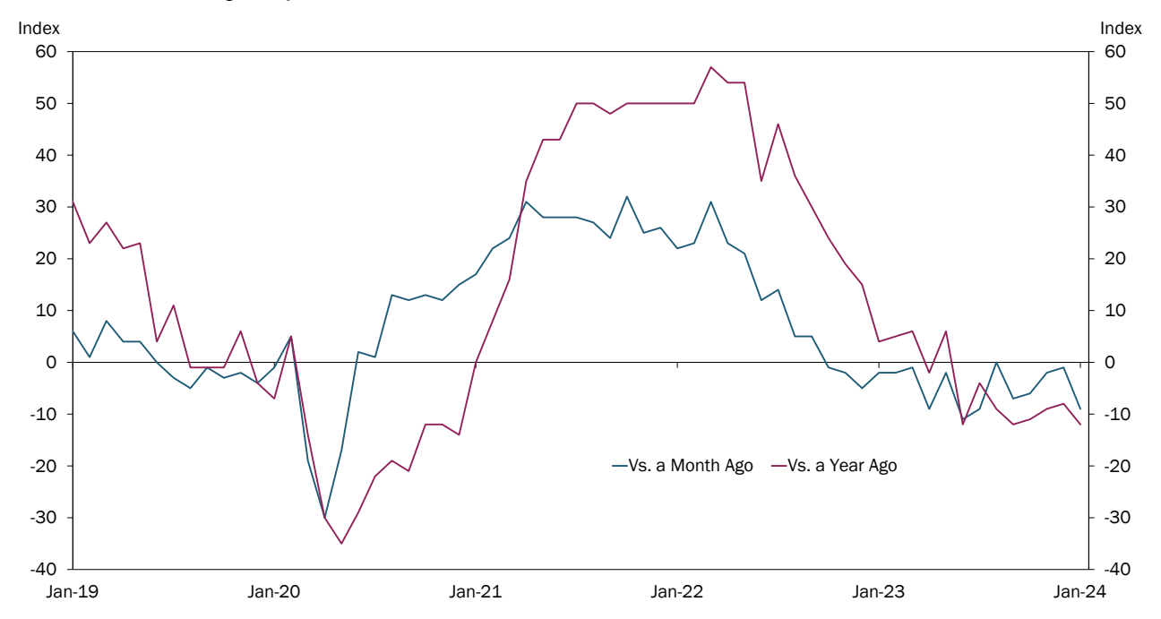
Chart 1. Manufacturing Composite Indexes

Note: The January survey was open for a six-day period from January 17-22, 2024 and included 90 responses from plants in Colorado, Kansas, Nebraska, Oklahoma, Wyoming, northern New Mexico, and western Missouri.