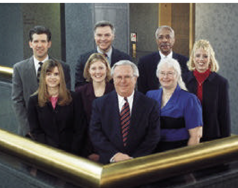
We enhanced the effectiveness of our supervision by opening an Examinations and Inspections Department at the Omaha Branch Office in March 2000.